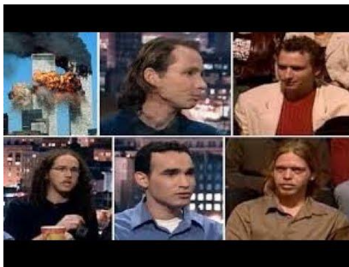
Three of the five 'Dancing Israelis' appeared on Yair Lapid's television show and admitted they were in NYC on 9/11 to "document the event."