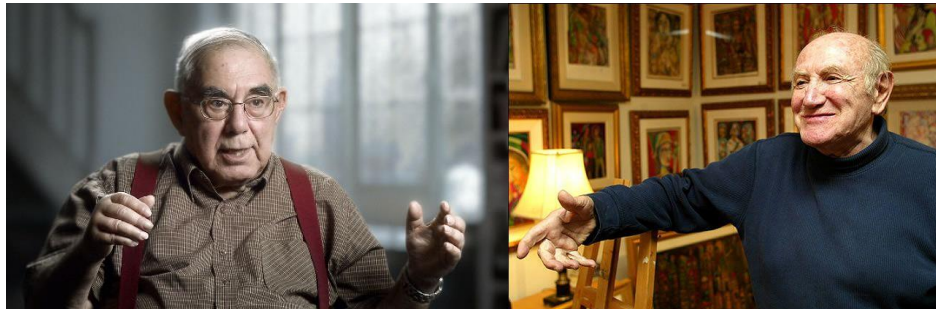
Mossad agents Avraham Shalom-Bendor and Peter Zvi Malkin secured the WTC security contract in 1987 on behalf of Shaul Eisenberg's Atwell Security of Tel-Aviv.

In 1987, two of Isser Harel’s top agents, Peter Zvi Malkin and Avraham Shalom-Bendor, obtained the WTC security contract while working for a company owned by Shaul Eisenberg called Atwell Security of Tel Aviv. Malkin and Bendor both worked under Harel for decades and were involved in top-secret Mossad missions including plutonium smuggling and the kidnapping of Adolf Eichmann from Argentina in 1960. Harel was eventually forced to resign as head of Mossad once his activities as part of Operation Damocles were exposed; these included mailing letter bombs and assassinating German scientists who were working alongside Egyptians on a rocket program.